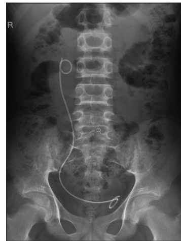
Figure 4: Post-operative kidney, ureter and bladder X-ray with DJ stent

gradual nature of the hydronephrosis. However, symptoms can occur earlier [13,14] as in our case in which symptoms manifested at 12 years of age and also reported in neonatal period. [15] Patients usually complain of right-sided flank pain and features of recurrent UTI, which typify the mode of presentation. In some cases, hematuria and renal stone may also be present. However, it should be noted that some cases remain asymptomatic and are only incidentally discovered during evaluation for unrelated disease conditions.