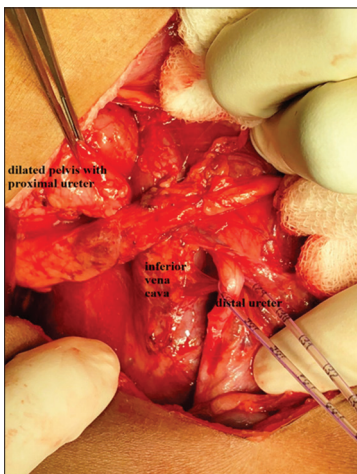
Figure 2: Intraoperative pic of retrocaval ureter with dilated pelvis and proximal ureter, vena cava, and distal ureter