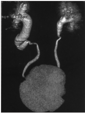
Figure 1: Pre-operative #D reconstructive image of computerized tomography urography reveals right retrocaval ureter with proximal dilated pelvis and proximal ureter