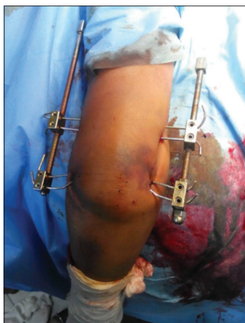
Figure 2: Final construct