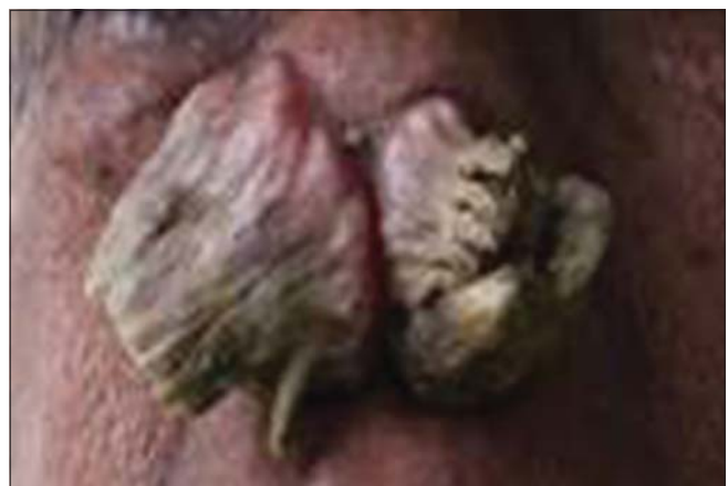
Figure 2: View of the lesion, obstructing both the nares