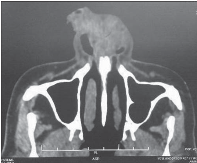
Figure 3: Computed tomography showing the growth being localized to the nasal vestibule