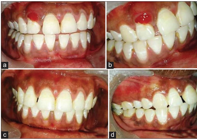
Figure 3: Clinical photograph of the patient with recurrence of lesion 10 days after complete excision (a and b) and follow-up photograph of the patient 1 month after periodontal treatment (c and d)

The present case belongs to type 3 as no known allergen was identified. PCG mimics lesions related to discoid lupus, lichen planus, cicatricial pemphigoid, and leukemia. However, in the present case, the lesion was slightly elevated clinically giving the appearance of periodontal abscess and pyogenic granuloma. Therefore, in addition to clinical and histopathological examination, the diagnosis requires hematological screening.