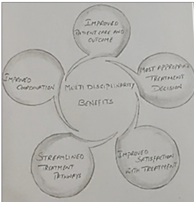
Figure 2: Multidisciplinary prosthodontics benefit

and successful outcomes. Oral radiology is vital for the assessment of structures such as jaws, jaw relationships, denture foundation, the position of anatomical landmarks, bone height-width, tooth condition, and their position in the arch. Radiology is of two types, intraoral radiography and extraoral radiography.