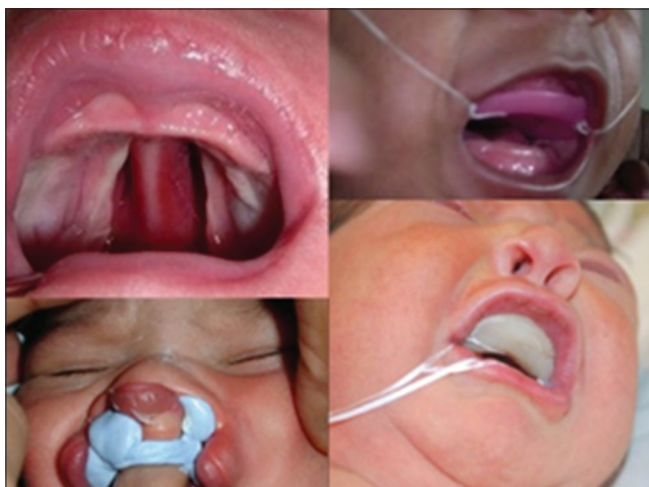
Figure 4: Prosthetic management of cleft conditions

nasal deformity non-surgically and addressing the shortness of columellar length deficiency and alveolar segment malposition with minimal surgery. Frequent surgical intervention to achieve the desired esthetic results can be avoided by PNAM. [25]