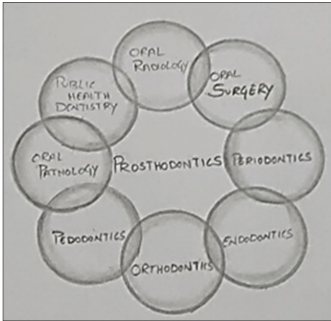
Figure 1: Multidisciplinary prosthodontics