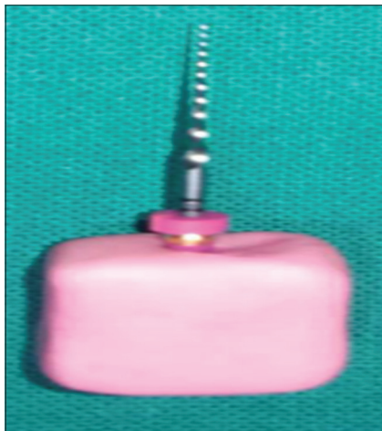
Figure 1: File mounted on the rubber block

The mean value of Group D-control (mean = 2.6420) was statistically higher when compared with Group B