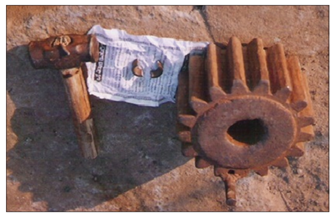
Figure 3: Broken nut with iron pedestal with hammer

The last point was taken and his penis with nut was put on the iron pedestal and the nut was hammered (Figure 4). Luckily the nut was broken into two pieces and totally penis became normal.