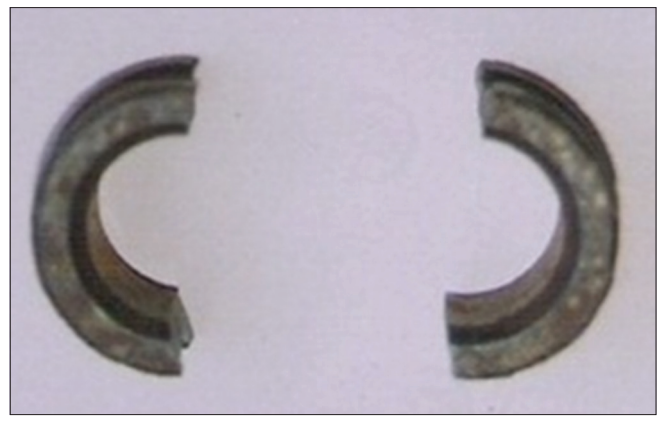
Figure 4: Pieces of nut and joined pieces together

• Nut round the penis is not uncommon in young male people and on and off it is seen in literature and treatment is individualized