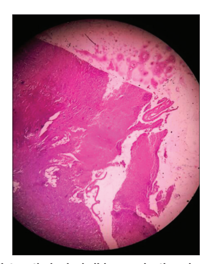
Figure 1: Histopathological slide examination showing hydatid cyst with normal kidney tissue

Human hydatid cyst or cystic echinococcosis is a global health problem worldwide, having variable geographical distribution particularly in the sheep-rearing regions of Australia, South America, North Africa, Russia, and China.<sup>3</sup> In developing country like India, hydatid cyst is an emerging disease with incidences being reported throughout the country.<sup>4,5</sup> In the small intestine (proximal small bowel), adult worm of E. granulosus lives attached with the help of hooklets to the mucosa. It releases eggs into the host's intestine and excreted in the feces. Human may become intermediate host through contact with a definitive host (usually a domesticated dog) or ingestion of contaminated water or vegetables. When embryo passes through the intestinal wall to reach the portal venous system or lymphatic system, the liver acts as the first line of defense and is, therefore, the most frequently involved organ. 6 Liver accounts for approximately 75% of cases of hydatid disease in humans and lung accounts for 15% of cases. Bloodborne dissemination may be seen in almost any anatomic location is leading to secondary involvement. Even in endemic areas, hydatid disease involving kidneys are extremely rare,