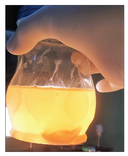
Figure 2: Ruptured hydatid cyst in urine sample