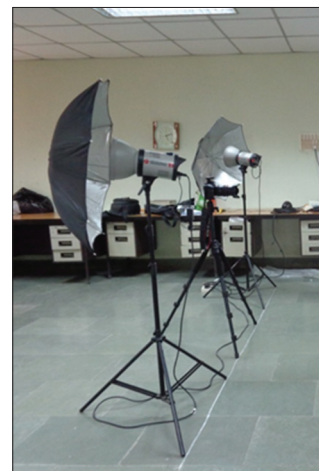
Figure 2: Photographic set up