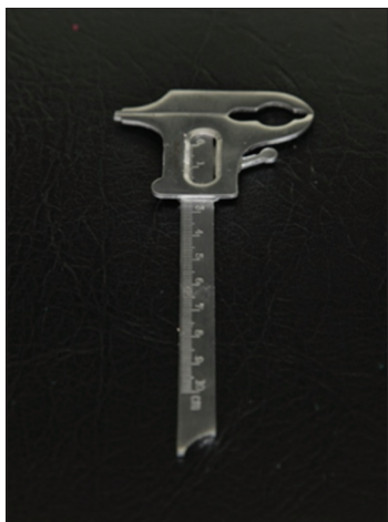
Figure 1: Vernier caliper