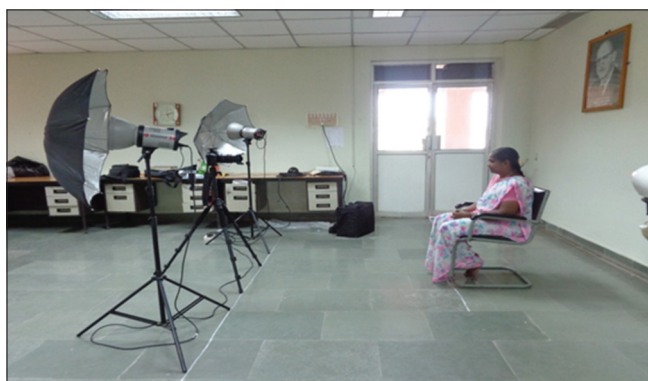
Figure 5: The photographic set up