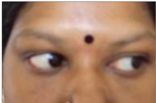
Figure 4: After treatment right eye adduction and left eye abduction present

and they may begin immediately or be delayed. 3 Features of dystonic reactions are intermittent spasmodic or sustained involuntary contractions of the face muscles, pelvis, trunk, extremities, neck or sometimes and even the larynx. 4 Dystonic reactions even though are not life threatening but it causes stress to the patient and the family. Mechanism of dystonic reactions in many drugs is by nigrostriatal dopamine D2 receptor blockade, which in turn causes an excess of striatal cholinergic output. High-potency D2 receptor antagonists mostly will produce an acute dystonic reaction. 5 As there is diminished numbers of D2 receptors in old age there is less risk of dystonia in elderly age. 6 Dystonia is more common in younger females, but the reason is unclear. Dystonic reactions usually occur shortly after initiation of drug; 50% occur within 48 h and 90% usually occur within 5 days of treatment. 7 Acute dystonia can be misdiagnosed and confused with encephalitis, complex partial seizures, tetanus, strychnine poisoning and hypocalcemic tetany so careful history eliciting is important. 8 People with family history of dystonia, recent use of cocaine or alcohol,