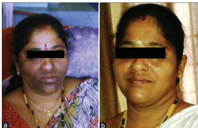
Figure 3: (a) Post-inflammatory pigmentation, (b) post-inflammatory pigmentation after treatment with 35% glycolic acid peel