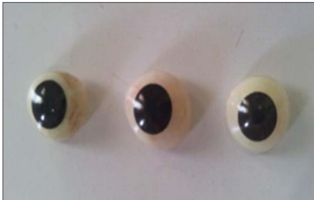
Figure 6: Different sizes of artificial eye