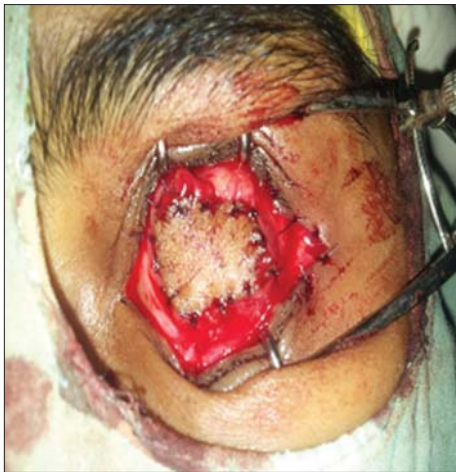
Figure 5: Graft implanted into the socket