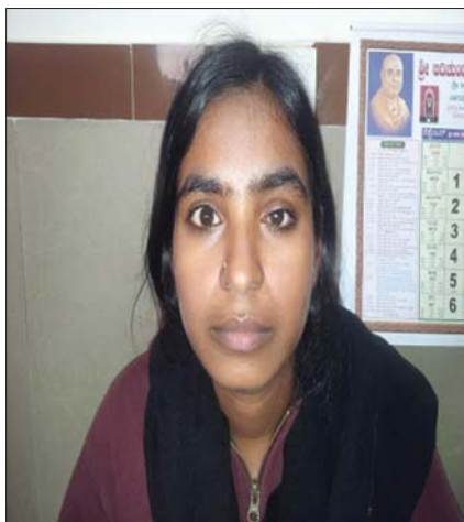
Figure 7: Prosthetic eye in situ

chemical burns, irradiation, systemic vascular disease, etc. it is contra-indicated. Other factors to minimize the complications