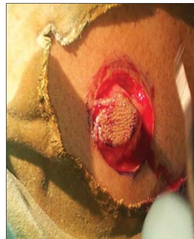
Figure 4: Derma-fat being taken from gluteal region

off from the graft. The DFG was then inserted into the orbital socket cavity with the dermis layer anteriorly, and the fatty side posteriorly oriented. The extraocular muscles and conjunctiva were sutured into the border of the DFG using 6-0 vicryl sutures for the former and 5-0 interrupted vicryl sutures for the latter (Figure 5). After instillation of antibiotic eye drops, the eye was patched with a light pressure pad.