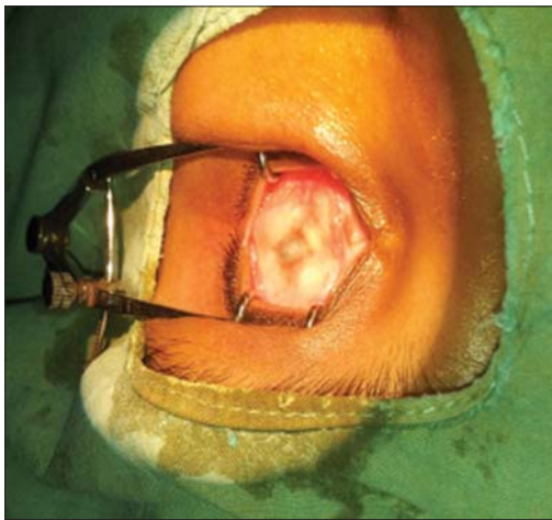
Figure 2: Pre-operative picture