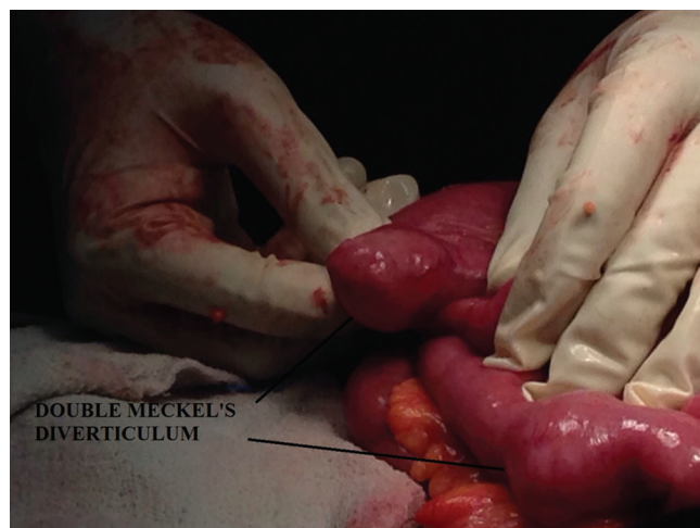
Figure 2: Double Meckels Diverticulum