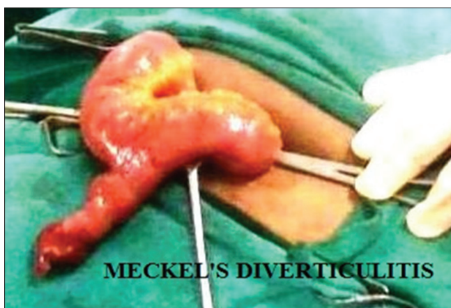
Figure 3: Meckels Diverticulitis

The management of symptomatic Meckel's diverticulum comprises surgical resection. A wedge resection of the Meckel's diverticulum is generally carried out, and occasionally some ileum is resected by end-to-end anastomosis diverticulectomy for Meckel's diverticulum found incidentally has been criticized. The results of surgical excision are generally excellent. Among the patients operated on for complications of Meckel's diverticulum, the cumulative incidence of early post-operative complications was 12%, including mainly wound infection (3%), prolonged ileus (3%), and anastomotic