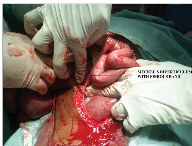
Figure 1: Meckels Diverticulum with Fibrous Band

A 50-year-old male presented to emergency with distension of abdomen for 2 days, not passing stools for 2 days, vomiting for 1 day. On examination, vitals were stable. Per abdomen distension of abdomen present with no palpable masses with increased bowel sounds, on digital rectal examination - rectum was empty with no fecal staining and palpable masses. Clinical diagnosis of obstruction was made, confirmed by X-ray erect