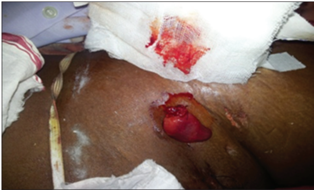
Figure 1: Right fallopian tube prolapsed, congested and oedematous like a small bowel

right salpingectomy was done. Left tube was found to be normal and healthy. Omentum, small bowel, and large bowel were inspected and found to be intact and normal. Post-operative period was uneventful. The patient was discharged in good condition. The excised right fallopian tube was sent for histopathological examination and was reported as the fallopian tube with submucosal edema, congestion, and features of acute inflammation (Figure 3).