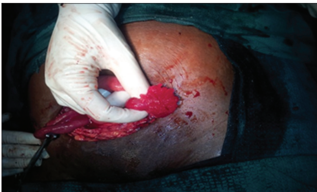
Figure 2: Fimbrial portion of congested and inflamed right fallopian tube (intra-operative)