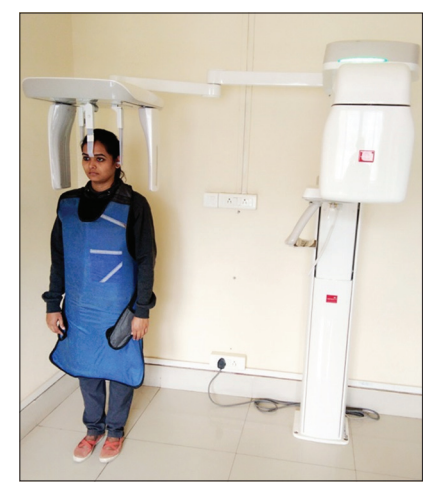
Figure 1: Patient position for lateral cephalogram

In our study, the mean value for convexity at point A was 1.38 \pm 2.44 mm while in Caucasian population it was 0.1 mm. The mean difference between two groups was 1.28 mm which was statistically significant ( P \le 0.001 ).