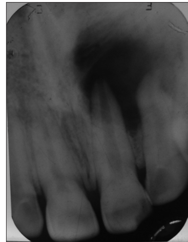
Figure 1: Radicular cyst

Different authors have shown the use of electrophoresis for the separation of the different protein fractions in the fluids of jaw cysts and thereby to distinguish between the different protein fractions both qualitatively and quantitatively. 6,7,10,11 Quantitative determinations of the protein fractions can be carried out either by elution or by scanning of the stained CAM strips by densitometer, which convert bands to characteristic peaks of albumin, alpha 1,