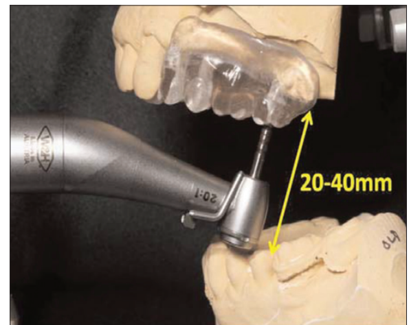
Figure 2: A surgical guide should have easy access to drills, osteotomes, and other devices commonly used during implant surgery