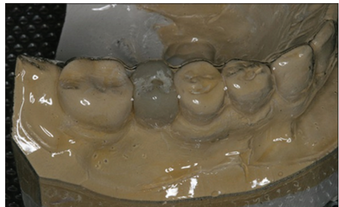
Figure 3: Clear vacuum shell adapted over diagnostic wax up duplicate cast

portion of the template should be maintained and cover the retromolar pads or tuberosities to aid in positioning.