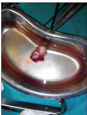
Figure 2: Tonsillectomy specimen