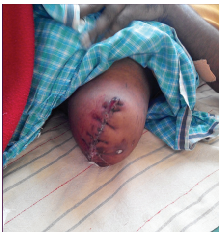
Figure 2: Post-op picture of the patient

up. Histopathology section showed spindle cells with a pleomorphic nucleus, and coarse nuclear chromatin, and prominent nucleoli (Figure 3). Immunohistochemistry from the growth showed diffuse cytoplasmic positivity to vimentin, focal positivity for smooth muscle actin and no reactivity for desmin and S-100.