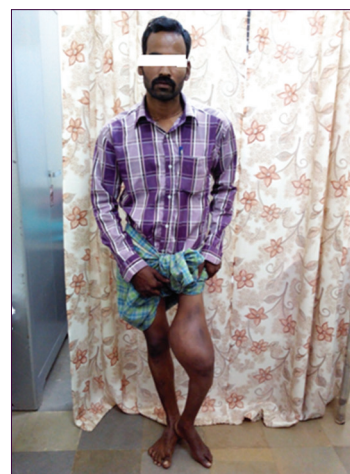
Figure 1: Pre-op picture of the patient

swelling in the polio affected limb since 4-5 months (Figure 1). He had no other symptoms and co-morbidities. His routine blood investigations were normal. Fine-needle aspiration cytology from the swelling showed features of soft tissue sarcoma probably MPNST. An incisional biopsy was done, which revealed spindle cell tumor suspicious of malignancy. Ultrasound abdomen and chest X-ray were done to rule out metastasis and were found to be normal. Because of the rapidity of the growth, above knee amputation was done (Figure 2). The patient was given radiotherapy and is in the regular follow-