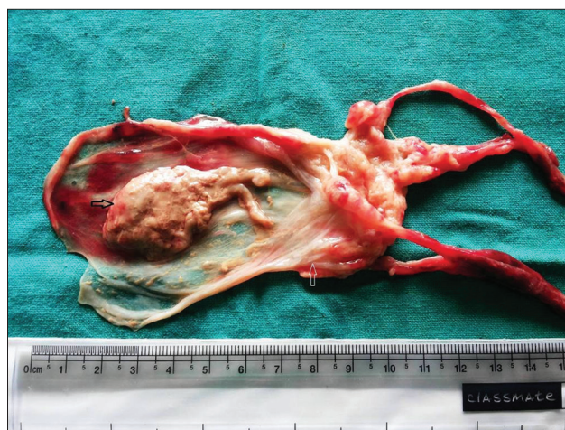
Figure 1: Gross specimen showing dead mummified fetus (black arrow) and the placenta (white arrow)

Being a rare complication, the incidence of FP has been reported at 1 in 12,000 pregnancies and ranges between 1:184 and 1:200 twin pregnancies. 6 But the actual rate of multiple pregnancies is significantly larger than that observed during labor because of the fact that in the