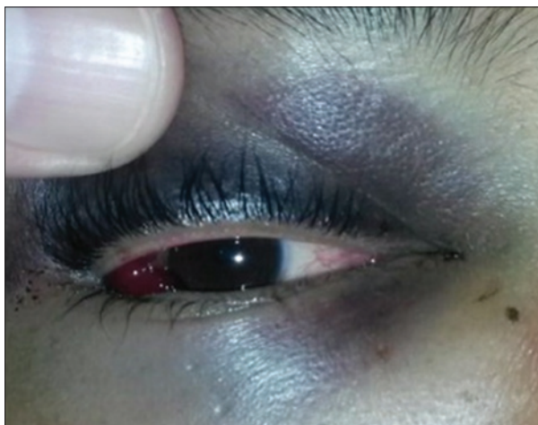
Figure 2: Periorbital ecchymosis with subconjunctival hemorrhage