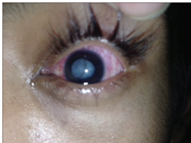
Figure 4: Traumatic cataract

the outer coats of the eyeball, the compression waves are reflected toward the posterior pole and may cause foveal damage