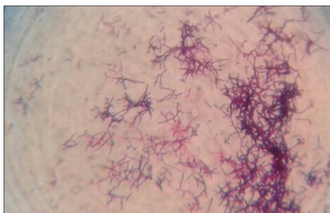
Figure 1: Gram stain of the culture smear showing gram positive coccobacilli with filamentous and branching forms

peripheral smear showed normocytic normochromic blood picture with neutrophilic leukocytosis. Screening tests for HIV, HBsAg and HCV were negative. Chest X ray was normal. Two days later when the swelling did not reduce synovial fluid was aspirated and sent to the microbiology laboratory. Gram stain of the fluid showed plenty of neutrophils and few gram positive coccobacilli. The fluid was cultured on Sheep blood agar and Macconkey agar and incubated aerobically at 37°C. After 48 hours of incubation smooth colonies 1-2 mm in diameter were seen on blood agar. No growth was seen on Macconkey agar. Gram stain of the colony showed gram positive coccobacilli with filamentous and branching forms (Figure 1). Weakly acid fast organisms were seen on modified acid fast stain with 1% sulphuric acid as decolouriser (Figure 2). The organism was identified as Rhodococcus equi based on the typical salmon coloured smooth colonies on blood agar seen after 4 days of incubation and biochemical reactions. The organism was nonmotile, catalase positive, oxidase negative, urease positive, indole negative, carbohydrate nonfermented. The organism was positive for CAMP test and grew minimally on tap water agar. Colonies