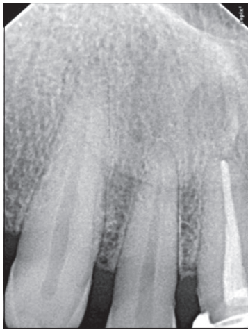
Figure 1: Peroperative IOPA with 12