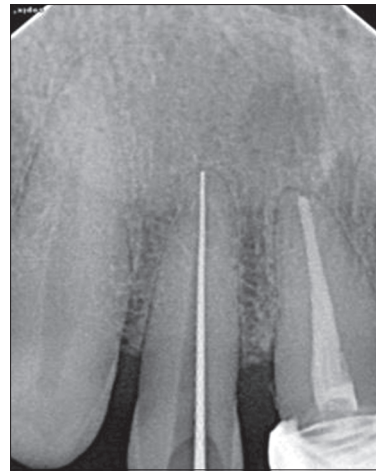
Figure 3: Working length of 12