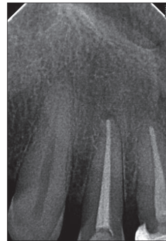
Figure 4: Obturation of 12

Based on the clinical and radiographic findings treatment plan was drawn and carried out as follows: