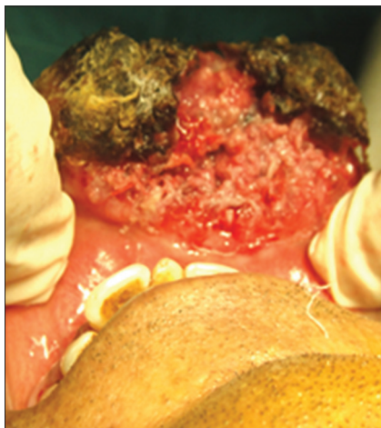
Figure 2: The close-up of lesion