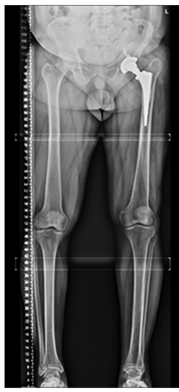
Figure 1: Modified teleoroentgenogram revealed limb length discrepancy with shortening of left femoral height

Based on clinicoradiological findings of implant loosening, left hip revision arthroplasty was undertaken and debrided tissue was sent for histology. The patient tolerated the procedure well and was ambulated on day 4 and subsequently discharged under antibiotic cover.