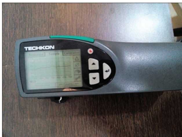
Figure 3: Spectrophotometer

where \Delta L^* , \Delta a^* , and \Delta b^* are differences in L^* , a^* , and b^* values before ( T_0 ) and after immersion at each time interval ( T_1 , T_2 , T_3 ). To relate the amount of color change ( \Delta E^* ) to a clinical environment, the data were converted to National Bureau of Standards (NBS) units 6 as follows: