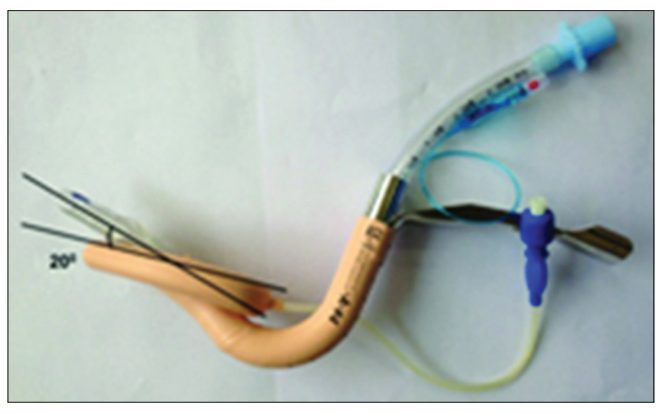
Figure 1: Angle of emergence of conventional endotracheal tube through intubating laryngeal mask airway in reverse orientation