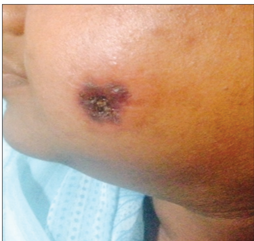
Figure 3: Eschar in a scrub typhus patient

Undiagnosed fever was the major inclusion criteria for the study. The other symptoms associated with fever also played a role in clinical suspicion towards a diagnosis of rickettsial infections. Among the 133 patients tested as part of the study, rashes and eschars were seen in 16 of the 29 Weil-Felix positive cases (55.17%). Figure 3 shows a typical eschar which was found on the cheek of a 48 year old female patient with OX-K titre of 1:320 and OX-2, OX-19 titres less than 1:80. However, all patients showing a positive WFT did not show a characteristic rash. We noticed that 09 patients who had fever and rash showed the negative result with WFT. A study by Udayan et al. showed 61.7% association 7 and a study by Mittal et al. showed 51.7% association of rashes with positive WFT. 5 Hepatomegaly was evidenced by 9 patients who showed OX-K levels >1:320. This was in correlation with the study by Udayan et al. 7 However, only 6 of these patients showed splenomegaly.