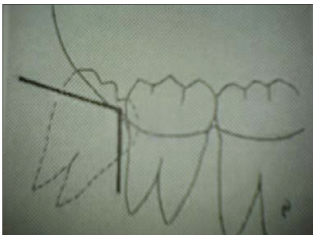
Figure 1: V-shape flap design

The small “V” shaped incision was made with one point at the distobuccal line angle of the second molar. One distal limb, which follows the external oblique ridge, and anterior limb avoids the gingival sulcus of the second molar and extends downward to the mucogingival junction (Figure 1).