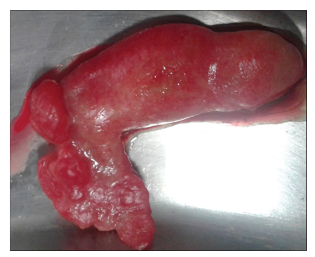
Figure 3: Resected end of fallopian tube

tubo-ovarian abscess or presence of infection. Although it is advisable to leave a pelvic drain when there is evidence of clotting defect, a drain is not a replacement for achieving hemostasis. There are proponents and opponents, but the type of drain and its use is largely a matter of personal preference. Different types of drains are used in the peritoneal cavity including passive, closed suction, and stump.