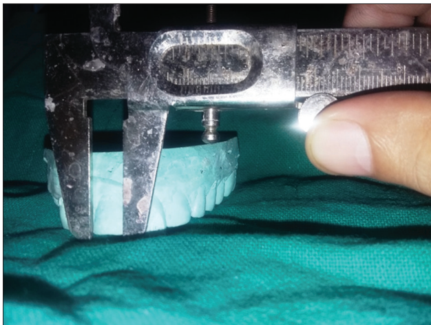
Figure 1: Measurement of mesiodistal width of individual tooth by Vernier caliper

In Group A (males), 11 was found to have mean width of 8.8 mm and that of 21 was 8.7 mm, 12 was having mean width of 7.6 mm and 7.4 mm for 22, and mean width of 13 was 8.5 mm and 8.4 mm for 23, whereas in Group B (females), 11 was having mean width of 8.6 mm and that of 21 was 8.5 mm. The mean width of 12 and 22 was 7.5 mm and 7.3 mm, respectively, and mean width of 13 and 23 was 8.2 mm and 8.1 mm. This demonstrates the variability in mesiodistal width between maxillary anterior teeth among males and females (Figure 1). The values obtained were different from that provided in books which could be due to regional differences or due to non-discrimination between subjects into males and females.