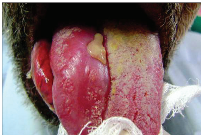
Figure 4: Bullae over right dorsum of tongue