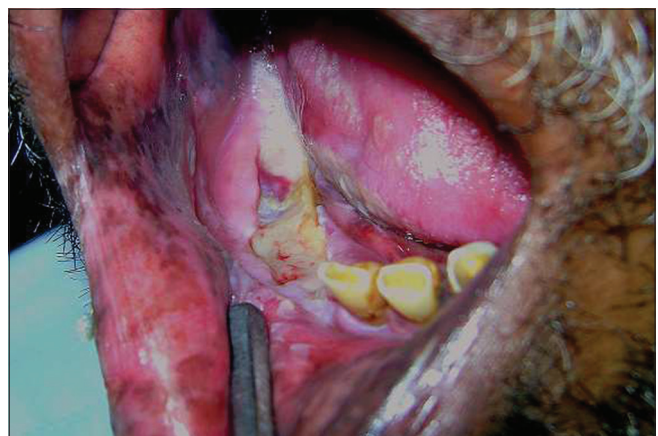
Figure 3: Necrosed right mandibular alveolus

dormant state after the initial infection until it gets reactivated decades later. The subsequent reactivation is herpes zoster. 6