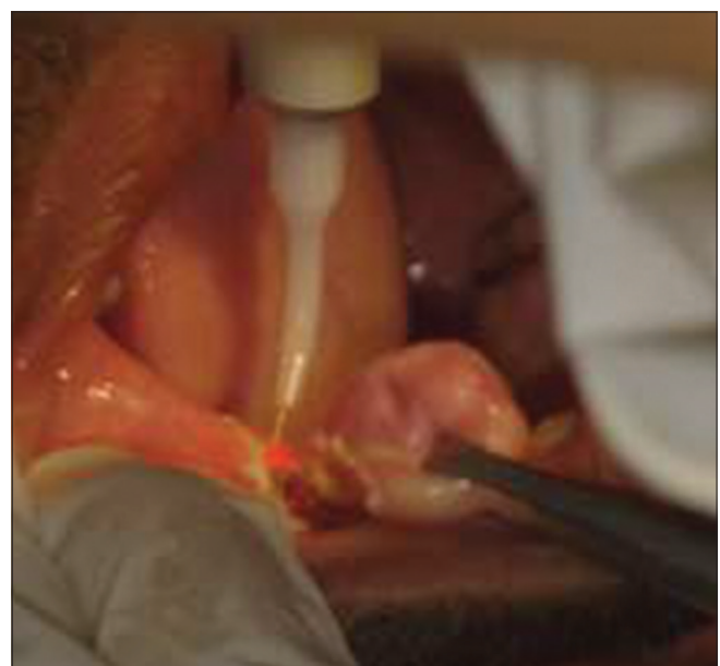
Figure 3: Surgical excision of fibroepithelial polyp using diode laser