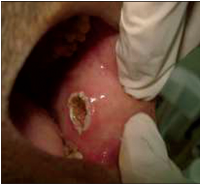
Figure 4: Post surgery carbonization present at the base of the wound