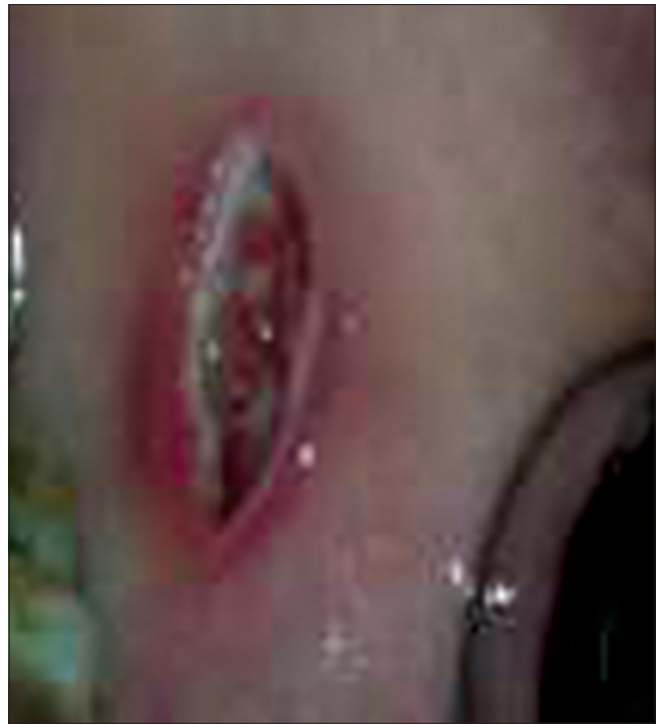
Figure 6: Seven day follow-up showing healthy granulation tissue at the floor of the wound

There are many different kinds of treatment modalities that may be followed for management of these hyperplastic tissues, such as scalpel excision, electrical surgery. In most cases where conventional surgery is done, complications such as intraoperative bleeding, difficulties in wound