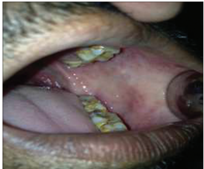
Figure 7: One month follow-up showing complete healing of the wound

healing and maintenance of sterility during surgery are very commonly seen. With the recent advancements and developments in the field of lasers diode lasers has become the choice of treatment for excision of such benign tissue growths. Diode lasers have been used in a variety of soft tissue surgical procedures mainly because of its ability to decontaminate and bactericidal property which is responsible for lesser pain and swelling and post-operative analgesia. Other advantages includes reduced scar formation and lesser bleeding which provides a bloodless