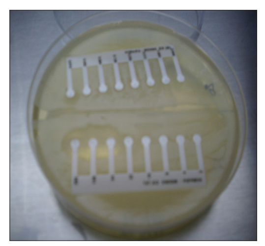
Figure 2: Hi comb Oxacillin MIC test of MRSA strains