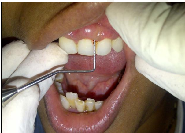
Figure 2: Bleeding on Probing During Routine Clinical Examination.